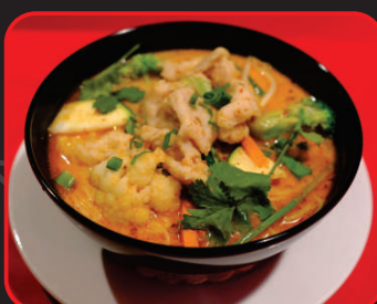
Laksa Soup Chicken $16.90 King Prawn $18.90