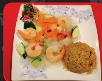
Garlic King Prawn Vegetables $19.90