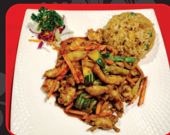
Satay Chicken $16.90