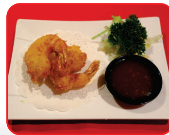
Coconut Prawn $5.90