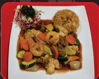
Cantonese Combination $17.90