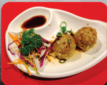
Dim Sim $4.90