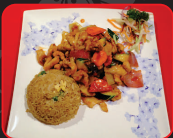
Thai Cashew Sweet Chilli Chicken or beef $17.90