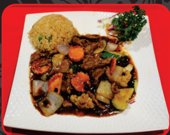
Beef with Black Bean sauce $16.90