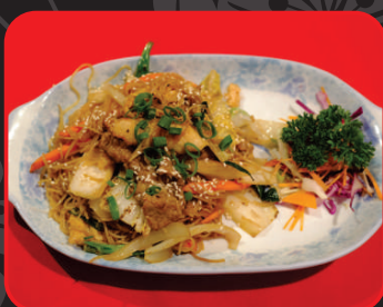
Singapore Noodle with soy or curry sauce $15.90