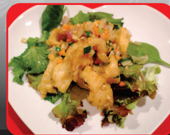
Salt & Pepper Calamari (Entree) $11.90