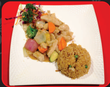
Garlic chicken/beef vege $16.90