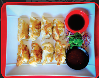
Handmade Dumpling $11.90