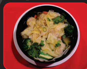
Wonton Noodle Soup $16.90