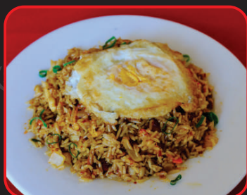
Nasi Goreng with Chicken $15.90