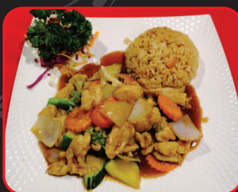
Honey Soy Chicken or Beef $16.90