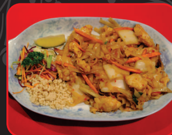
Pad Thai Chicken $15.90 King Prawn $18.90