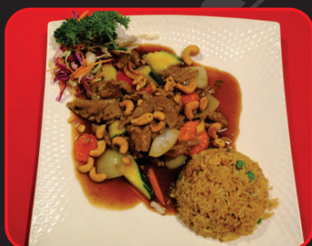
Chicken/Beef Vege and Cashew $17.90