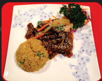
Crispy Beef $16.90