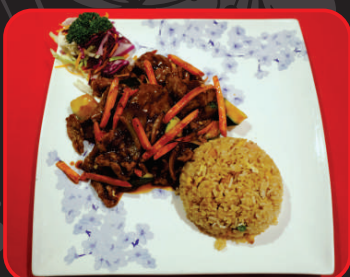
Mongolian Beef $16.90