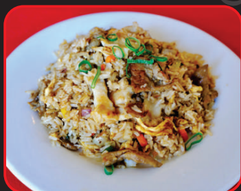
Chicken with Beef Fried Rice $15.90