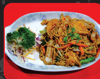
Teriyaki Chicken Noodle $15.90