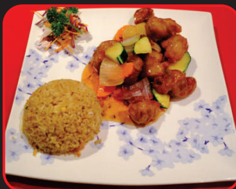
Sweet & Sour Pork $15.90