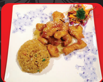
Honey Chicken $15.90