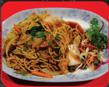
Combination Noodle $15.90