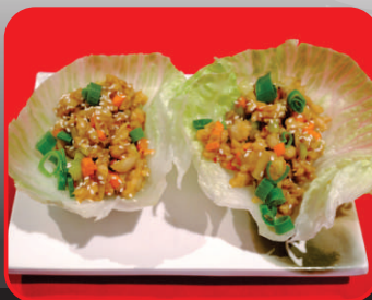
Shan Choy Bow $9.90